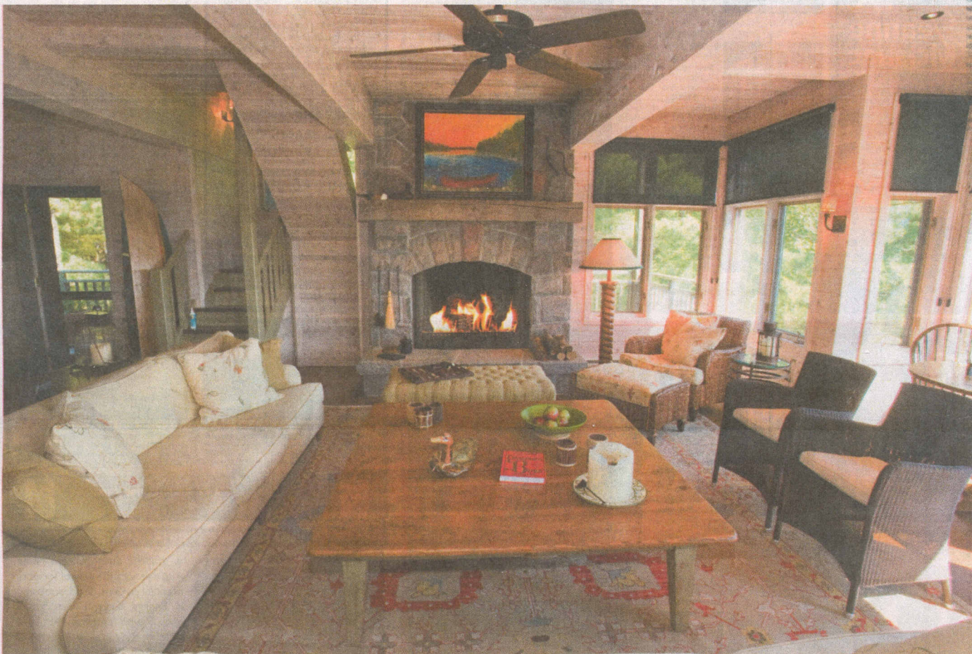
The large but cozy great room offers an excellent view of a private bay and pine forest, below. At bottom, the screened dining porch opens on to outdoor living space.